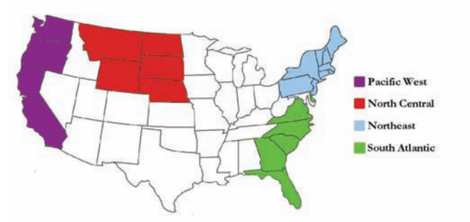
Figure 1. The four delineated regions of the contiguous U.S.

Virginia, North Carolina, South Carolina, Georgia, and Florida. The Pacific West region covers states of Washington, Oregon, and California.